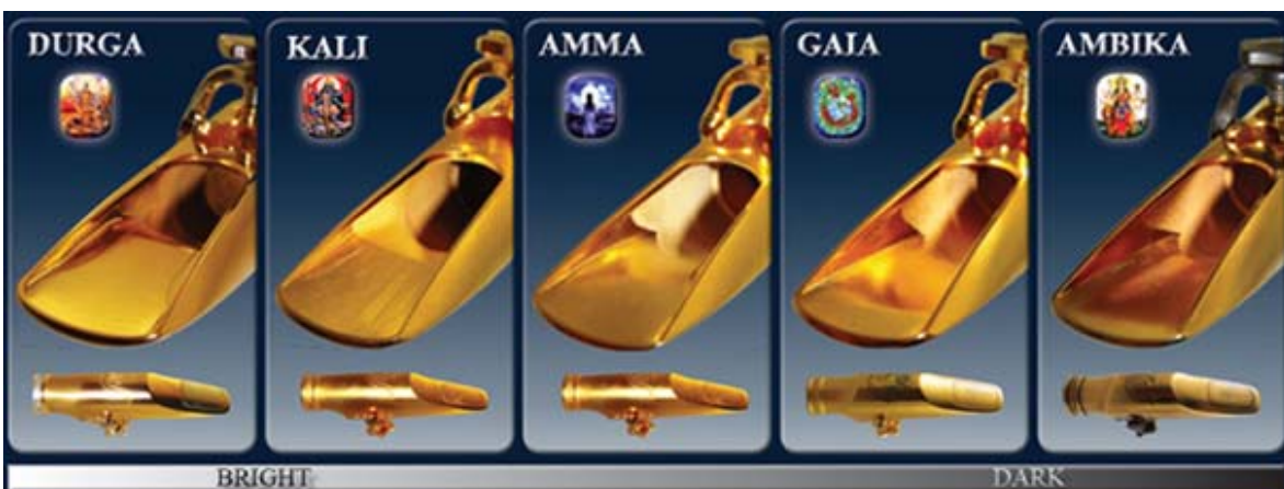
From the Forum

Theo Wanne mouthpieces have the world's most precise tips, side rails and chambers with incredible artistically-sculpted, CNCed, complex interiors.